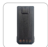
Battery 2000mAh BL2021