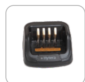
MUC Rapid-rate Charger