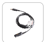
Programming cable PC155