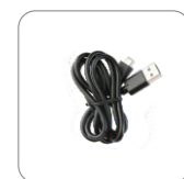
Data cable PC143